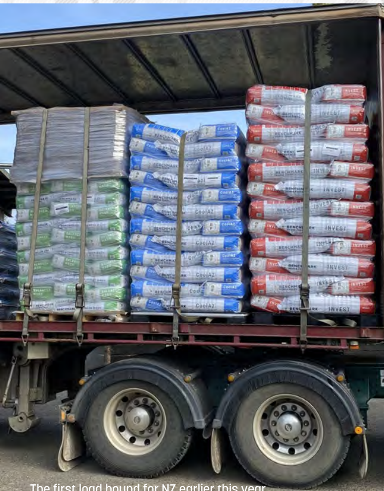
The first load bound for NZ earlier this year.