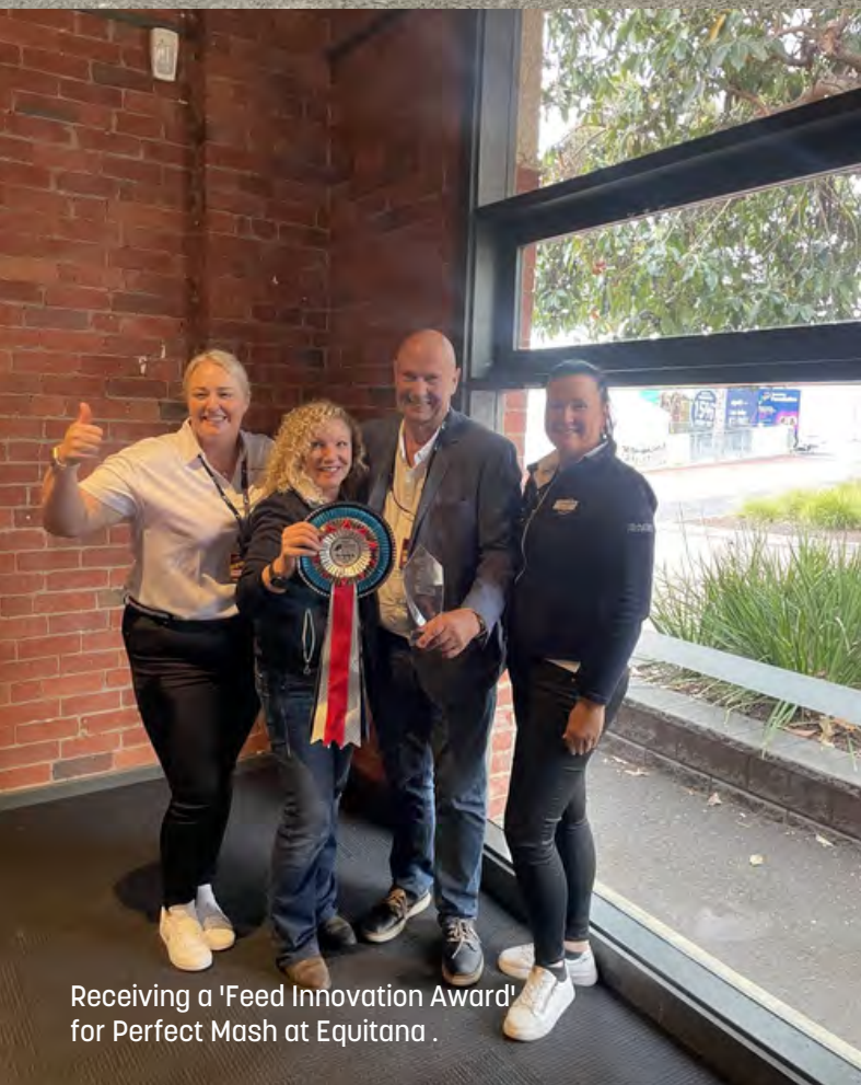
Receiving a 'Feed Innovation Award' for Perfect Mash at Equitana .

So, very different to hay and pasture and chaff, which are also clearly important to a horse's digestive system and health. Horses need long-stem fibre for a whole lot of reasons, but the fermentation of that fibre is quite inefficient and they have to eat a lot of it, which is why horses eat 22 hours out of 24. They've got to eat a lot of it to get sufficient energy for all bodily functions. It's a high-volume, low-energy intake and a slow fermentation process. Using a highly fermentable fibre accelerates that natural process and creates more energy per kilo and a lot faster. Basically, the energy from fermentable fibre is the same as grain starch, but it's obviously fat-based and not glycogen type energy, so it's a very natural process.